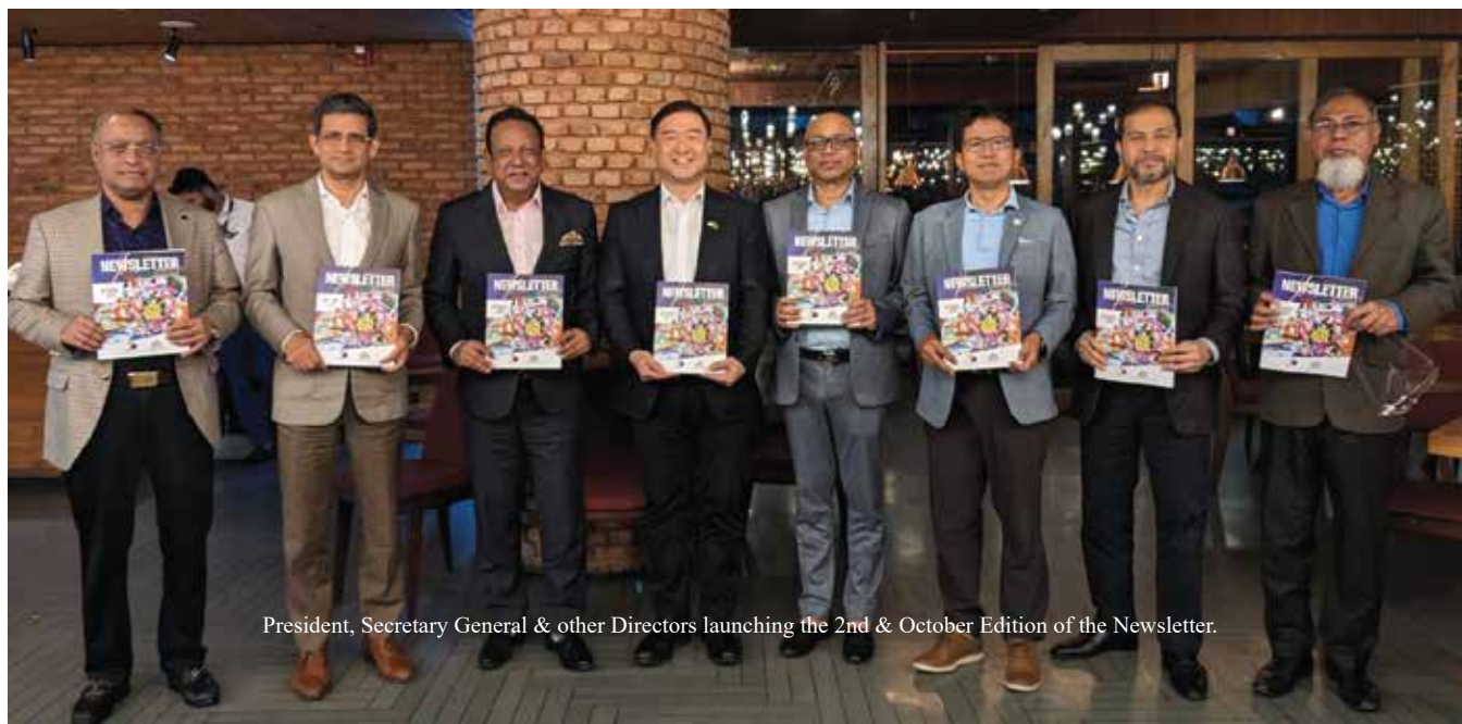
President, Secretary General & other Directors launching the 2nd & October Edition of the Newsletter.

The 5 th board meeting of the Korea-Bangladesh Chamber of Commerce and Industry (KBCCI) marked an important gathering focused on last year's agendas and planning key initiatives for the new year in celebration of the 51 st anniversary of bilateral relations between Korea and Bangladesh. The meeting centered on strategic discussions encompassing a diverse range of events and activities. From planning a Korean Film Festival and organizing a business delegation to Korea to evaluating proposals, establishing and reviewing standing committee activities, approving new members, addressing financial matters, and launching a newsletter, the meeting exemplified KBCCI's commitment to strengthening the bonds that have defined five decades of partnership between the two nations. This dynamic session explored to summarize the spirit of collaboration and innovation that has transformed the organization with positive atmosphere of growth and mutual success.