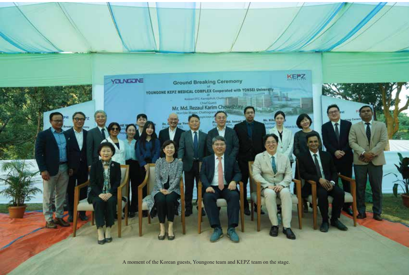
A moment of the Korean guests, Youngone team and KEPZ team on the stage.

The medical complex will comprise a 500-bed hospital. The purpose of this complex is to enhance healthcare services for the employees of Youngone and the companies within the KEPZ, as well as their families. The scope of this initiative will go beyond this, and gradually include the wider community in the surrounding area.