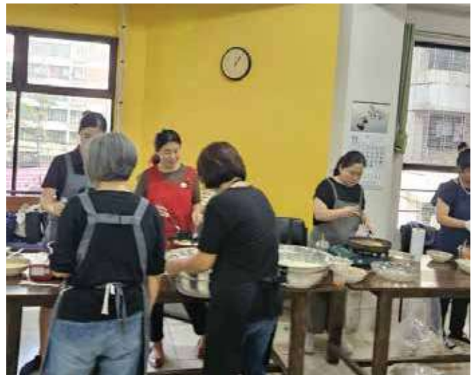
Some momentous activities from the Charity Bazaar.