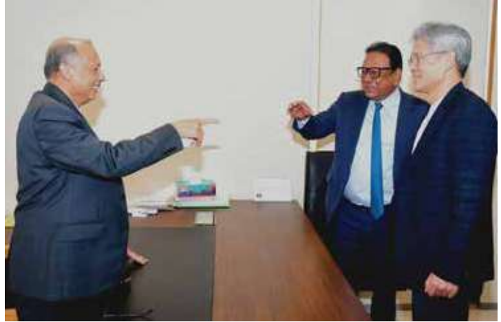
Leadership Harmony: Presidents in Good Spirits!