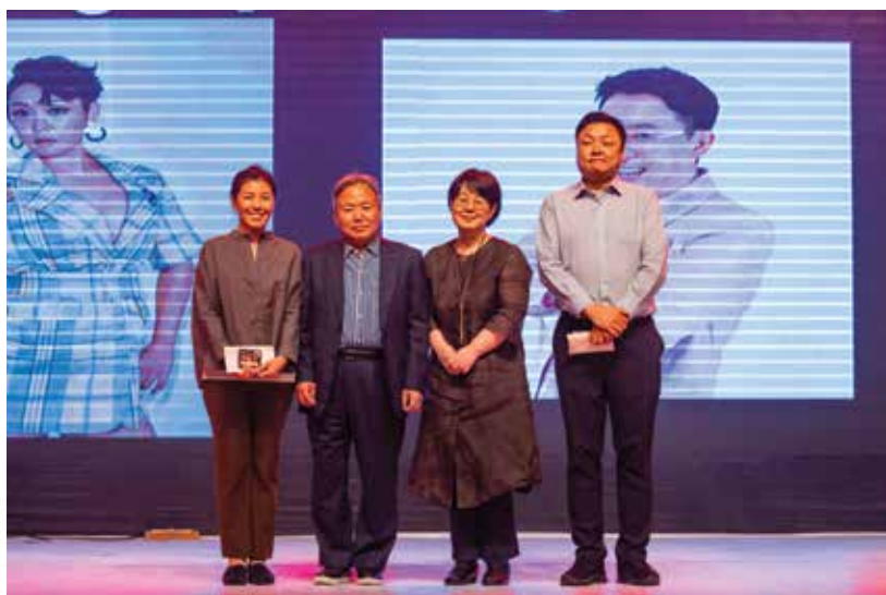
Honorable Ambassador & The First Lady with other dignitaries.