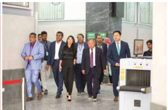
A moment of the Ambassador's tour to the campus.