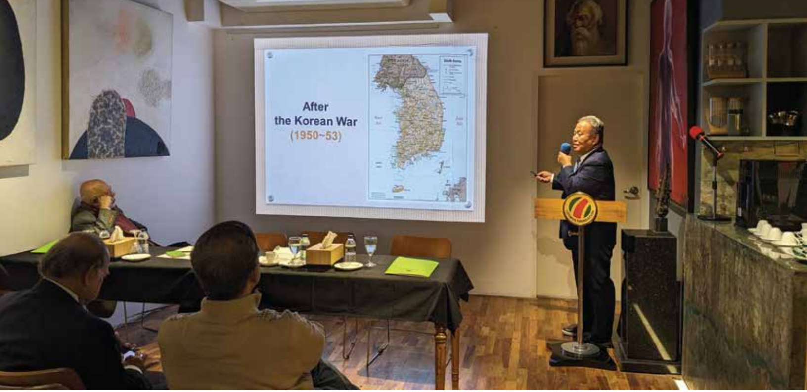
Honorable Ambassador presenting his keynote lecture.

The Ambassador, in his lecture, highlighted the overall history of the Korean economy starting from war, democracy, trade, labor market, economic policies to the fascinating growth of South Korea as a nation and how it became a greater economy since 1960 through education. He also spoke about the lessons