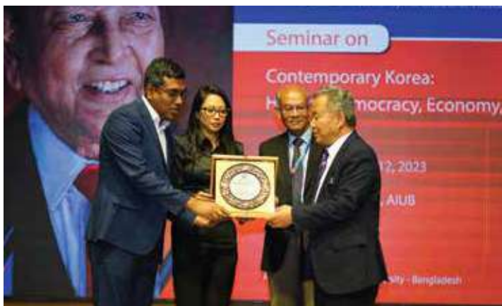
The Chairman of AIUB handing over a crest to the Ambassador.