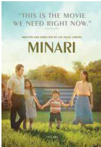
Minari - 2020