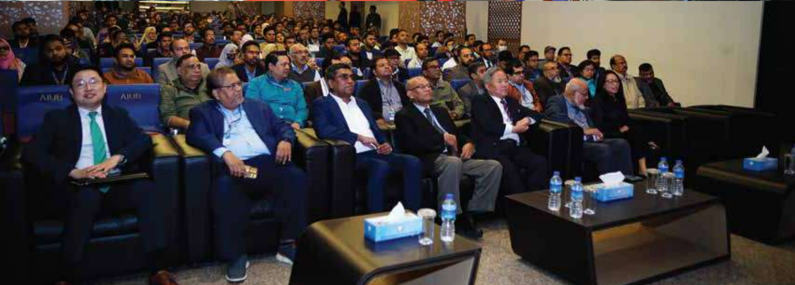
Glimpse of the management, guests and audiences at the auditorium.