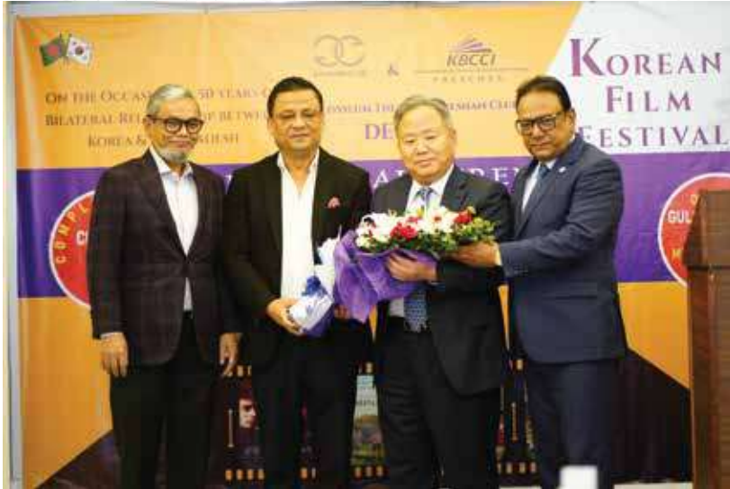
President of KBCCI & Former President of Gulshan Club greeting the Ambassador with a flower bouquet.