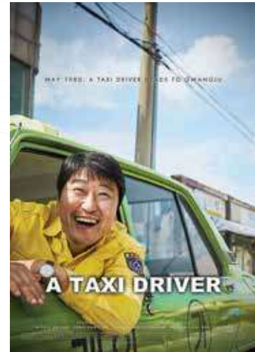
A Taxi Driver - 2017