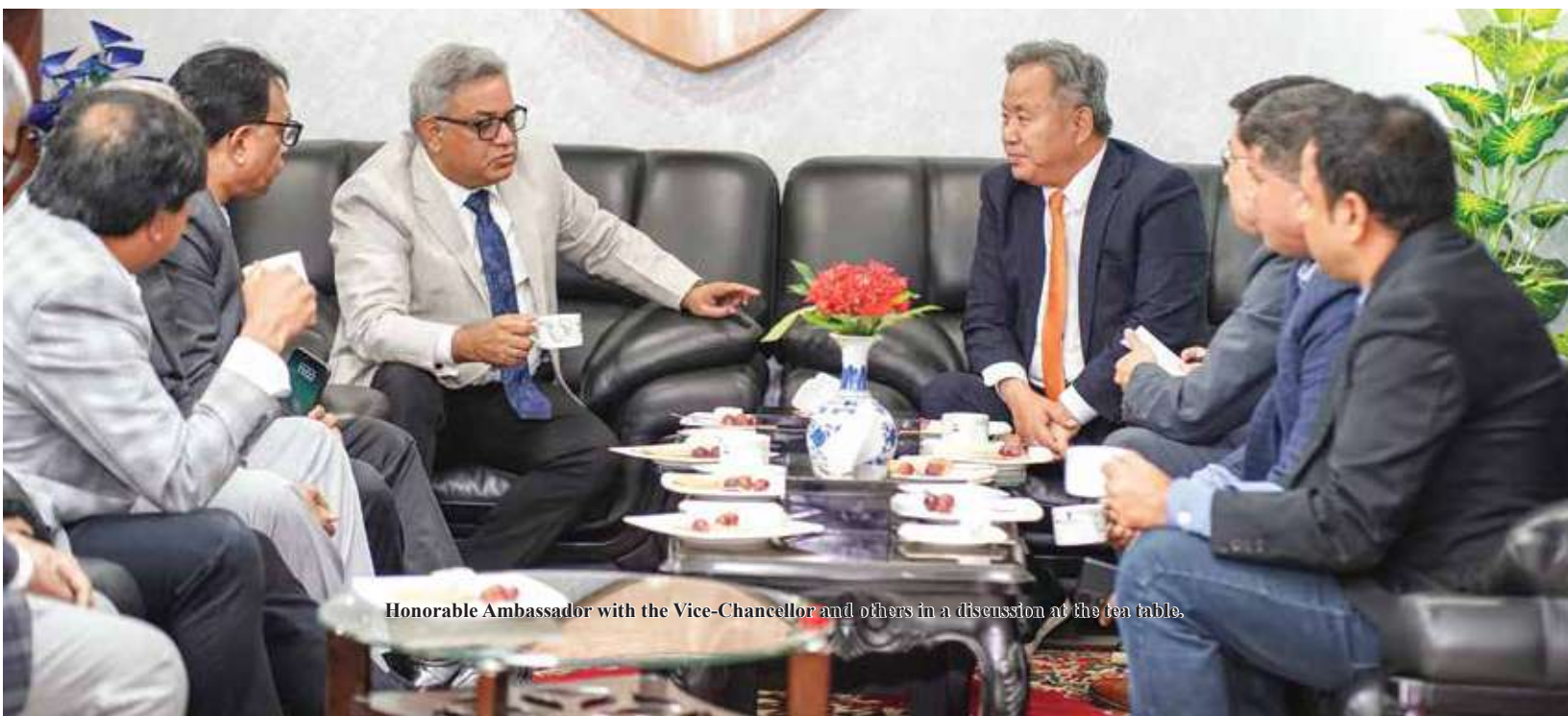
Honorable Ambassador with the Vice-Chancellor and others in a discussion at the tea table.