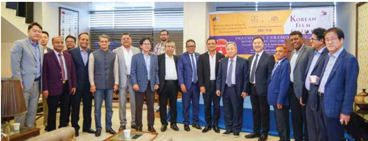
Board of Directors of KBCCI & Gulshan Club with the Honorable Ambassador.