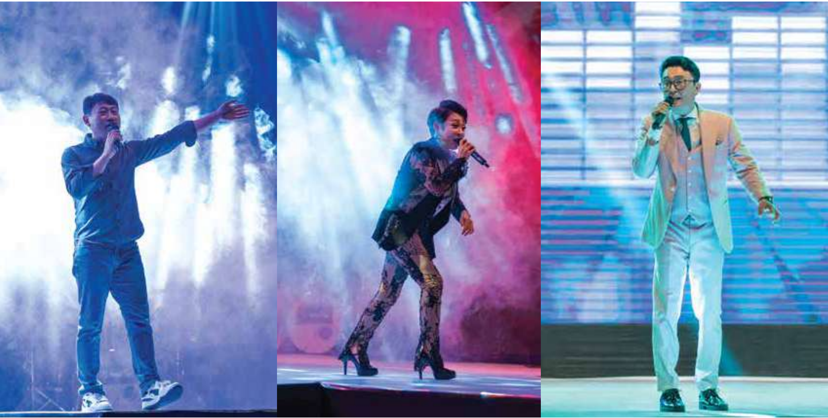
Korean Singers performing at the Gala Night.