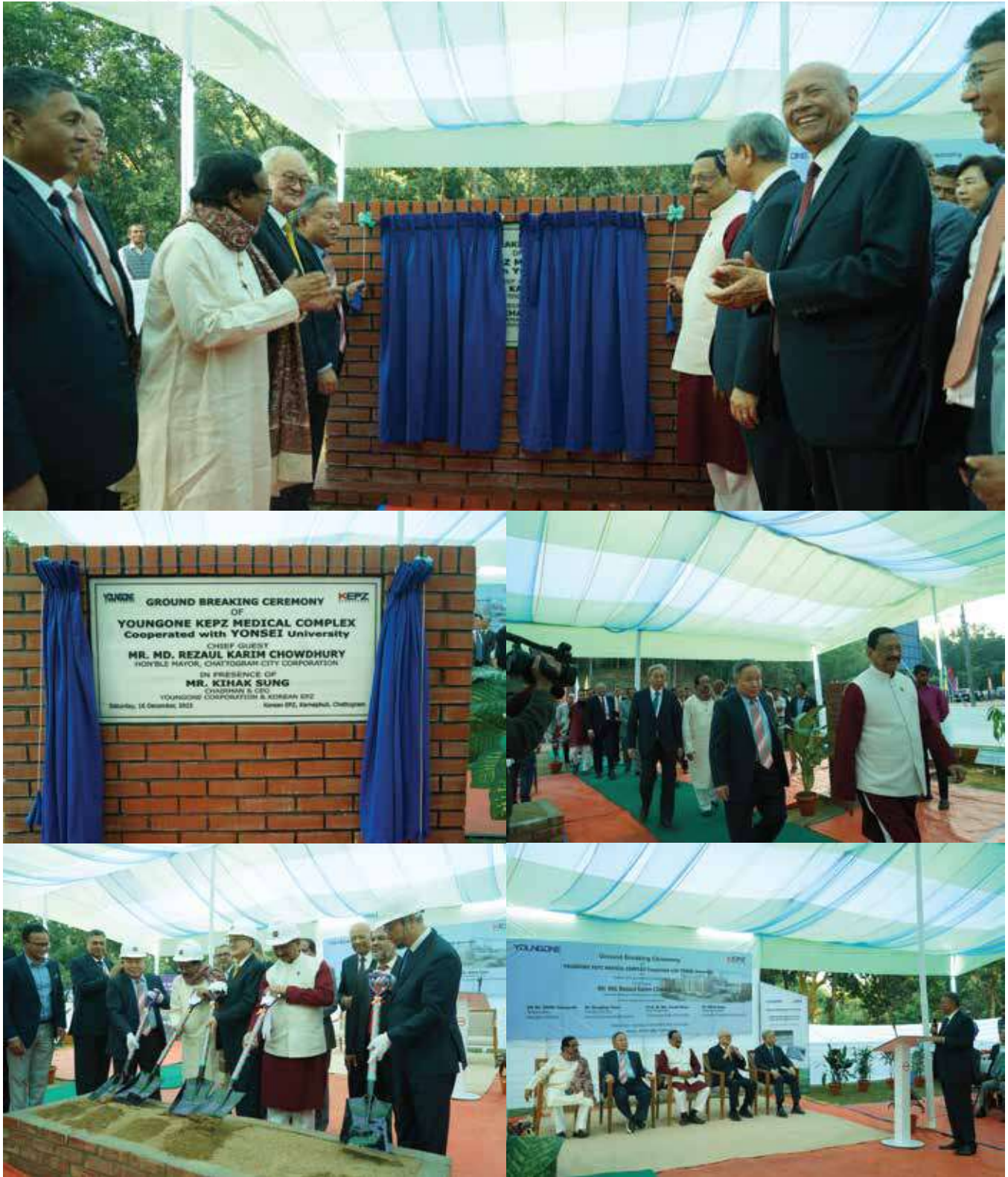
Some noteworthy instances of the ceremony.