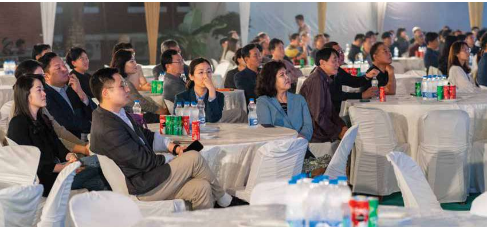
The residents enjoying the performances at the eventful occasion.