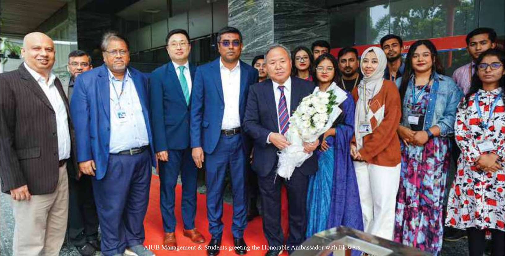
AIUB Management & Students greeting the Honorable Ambassador with Flowers.