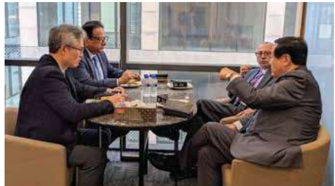
Former Ambassador, KBCCI President, FBCCI President & Chairman of Up & Down Stream Project Inc. in an engaging conversation at the tea table.