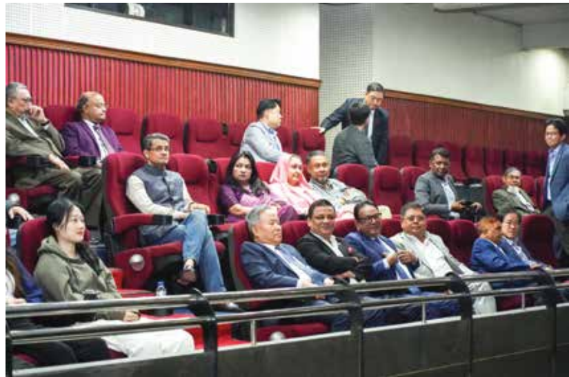
A glimpse of the audiences at the gallery of Colosseum Theatre of Gulshan Club before the first show.